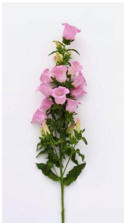
DEEP BLUE IMPROVED